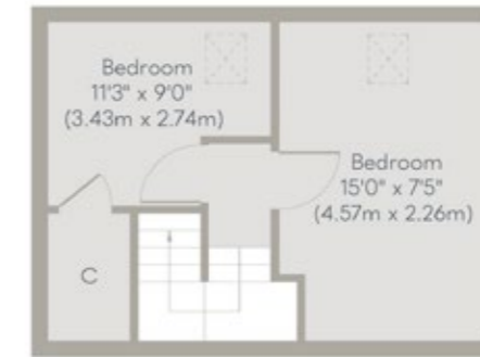
First Floor Approximate Floor Area 255 sq. ft (23.69 sq. m)