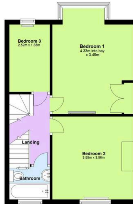
First Floor Approx. 41.2 sq. metres