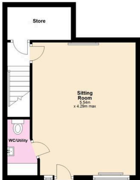
Lower Ground Floor Approx. 33.4 sq. metres