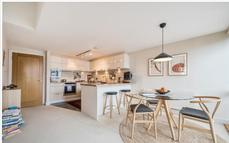
Open Plan Dining/Kitchen