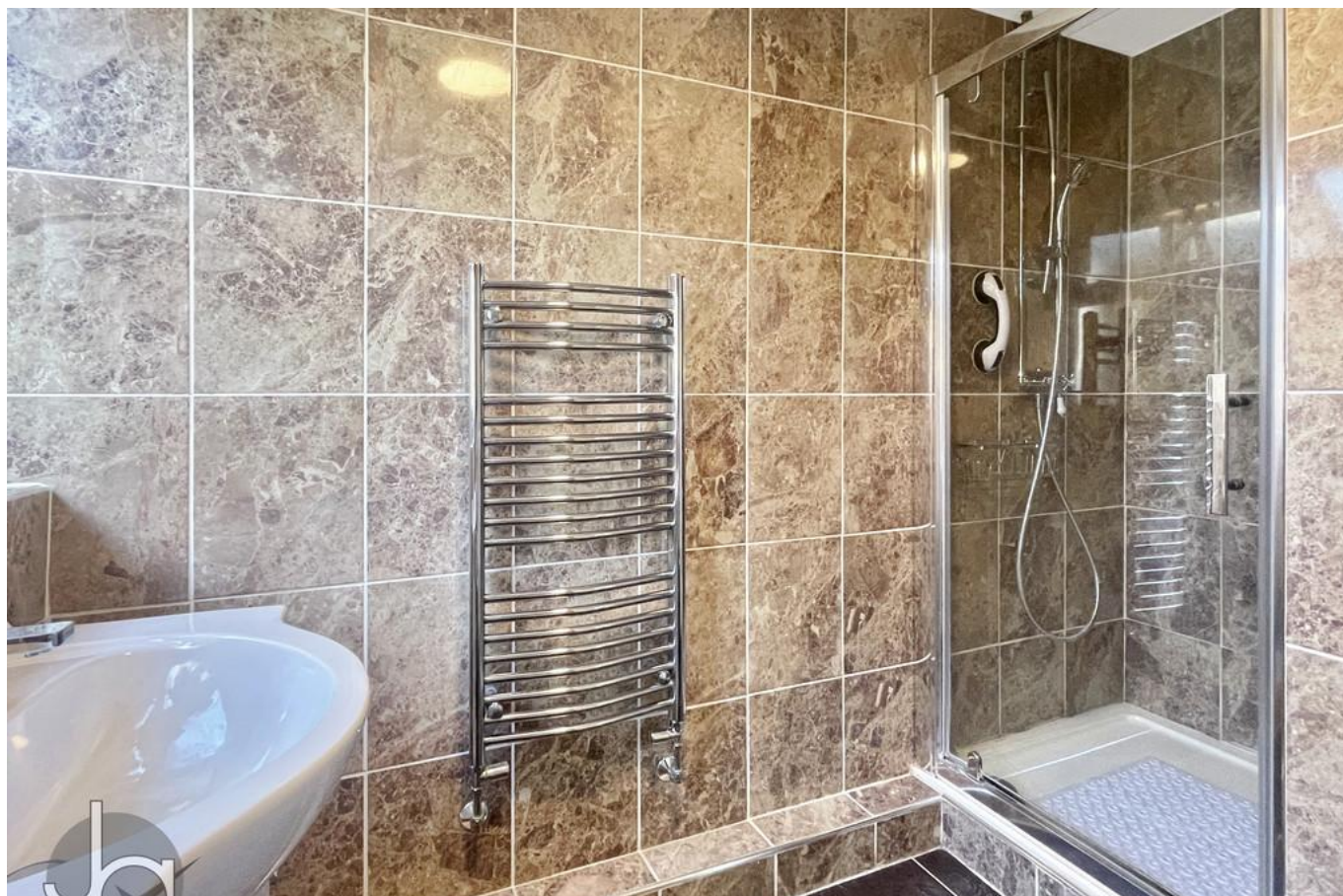
D'arcy Way, Tolleshunt D'arcy CM9 8UD