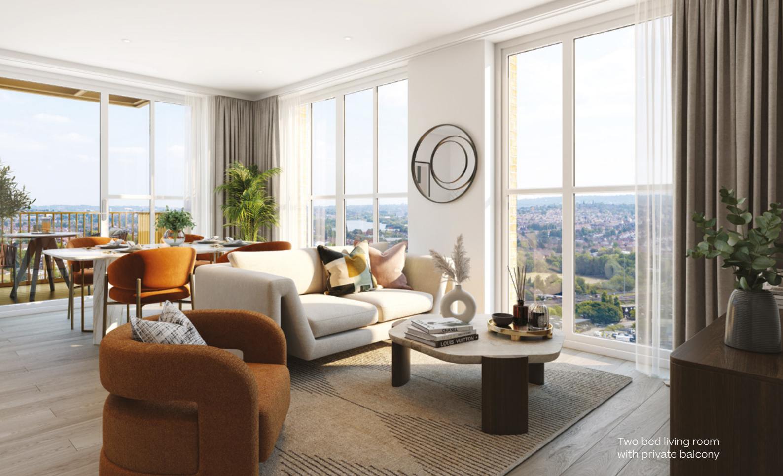
Two bed living room with private balcony