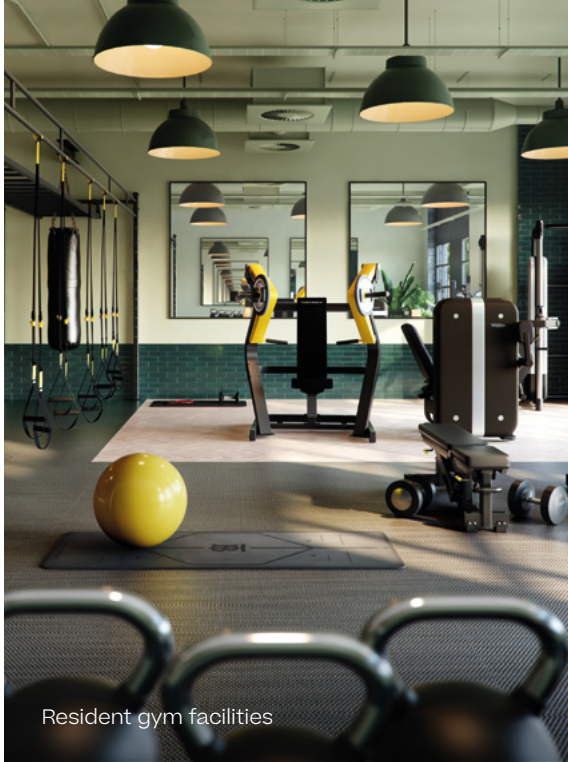
Resident gym facilities