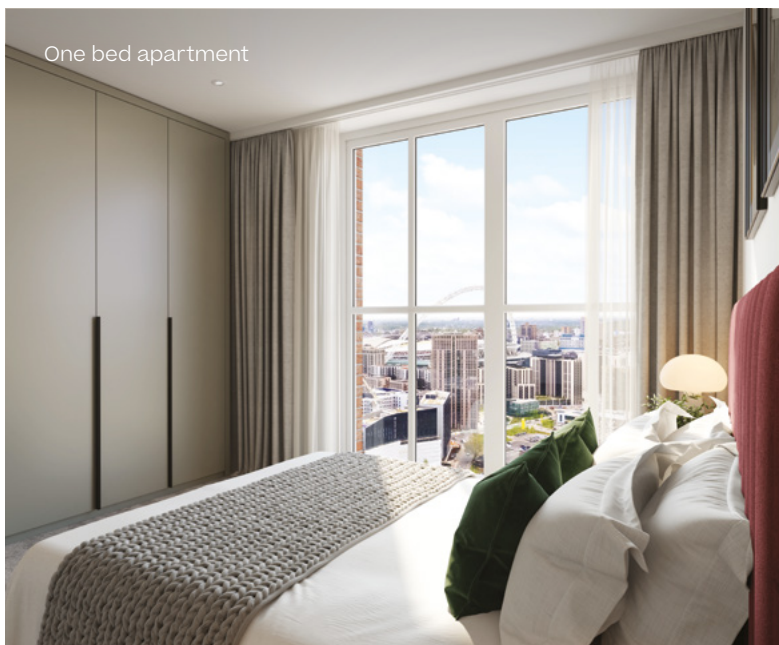
One bed apartment

Surrounded by beautifully landscaped spaces, each apartment welcomes plenty of natural light and views across the city. They are designed with quality fittings and finishes to foster simple, effortless living.