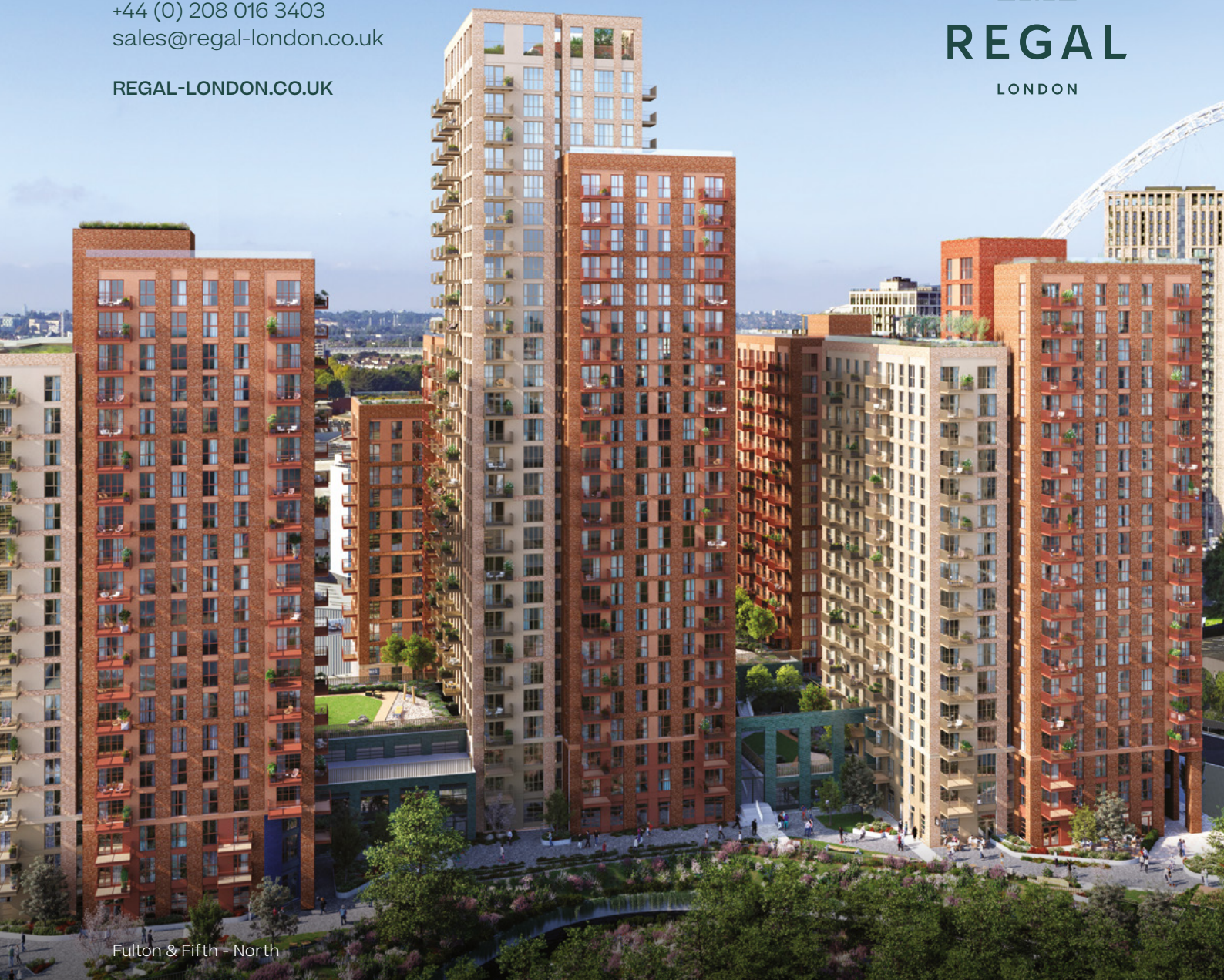
Fulton & Fifth - North