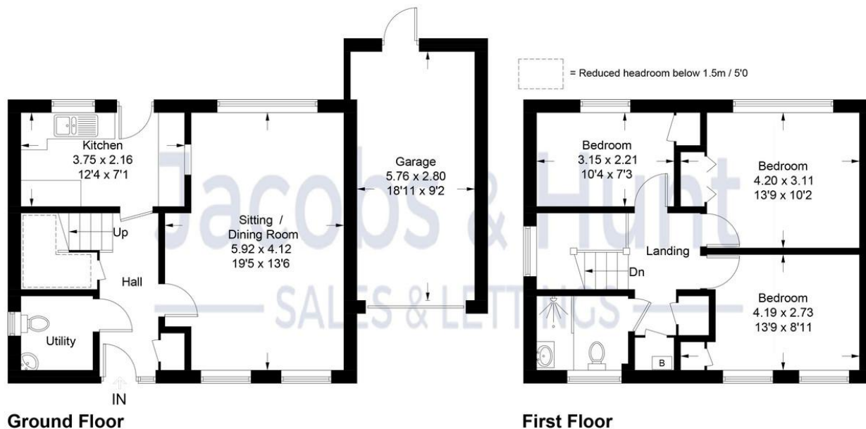
Illustration for identification purposes only, measurements are approximate, not to scale. (ID1231078)