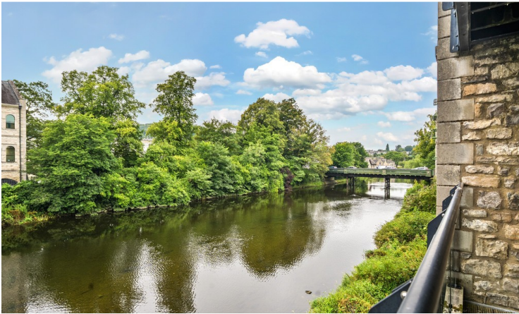
Views of the river