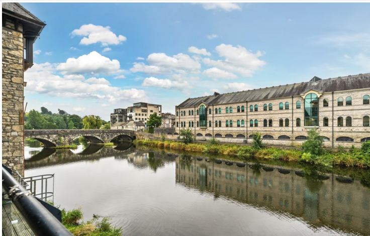
Views of the river

Anti Money Laundering Regulations: Please note that when an offer is accepted on a property, we must follow government legislation and carry out identification checks on all buyers under the Anti-Money Laundering Regulations (AML). We use a specialist third-party company to carry out these checks at a charge of £42.67 (inc. VAT) per individual or £36.19 (incl. vat) per individual, if more than one person is involved in the purchase (provided all individuals pay in one transaction). The charge is non-refundable, and you will be unable to proceed with the purchase of the property until these checks have been completed. In the event the property is being purchased in the name of a company, the charge will be £120 (incl. vat).