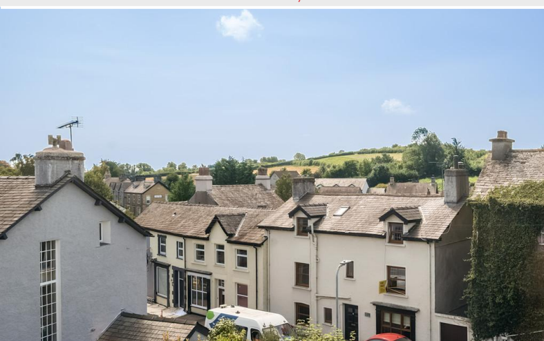
Views over Cark