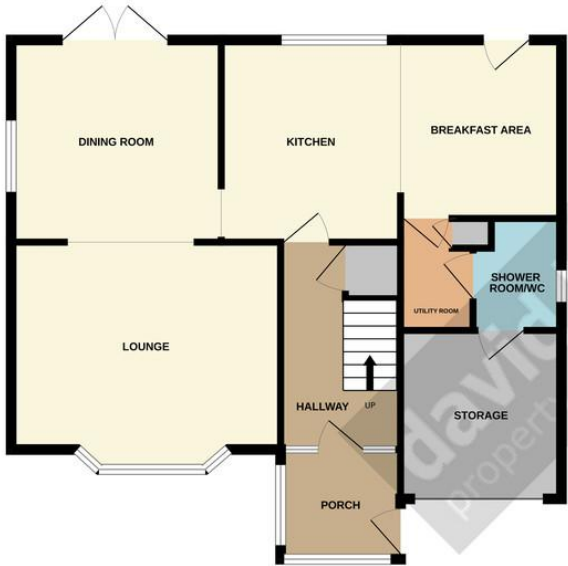
GROUND FLOOR 70.7 sq.m. (761 sq.ft.) approx.