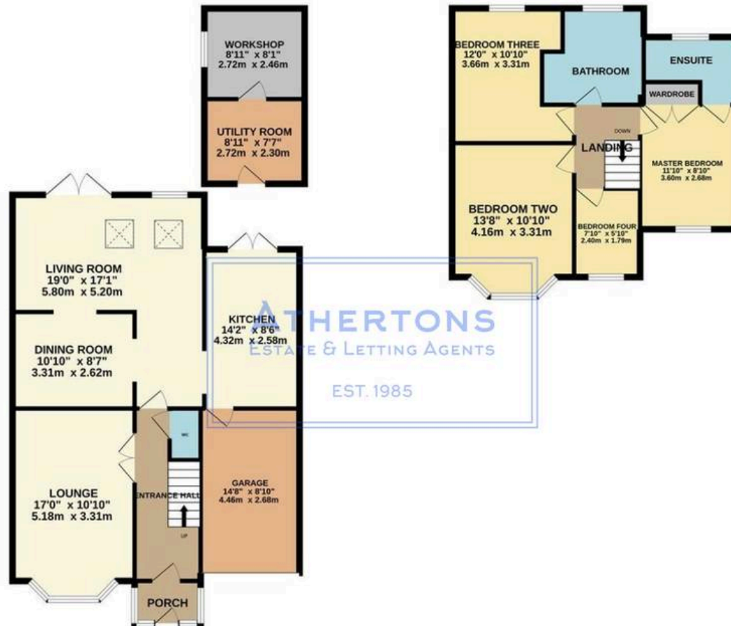
1ST FLOOR 562 sq.ft. (52.2 sq.m.) approx.

TOTAL FLOOR AREA: 1564 sq.ft. (145.3 sq.m.) approx.