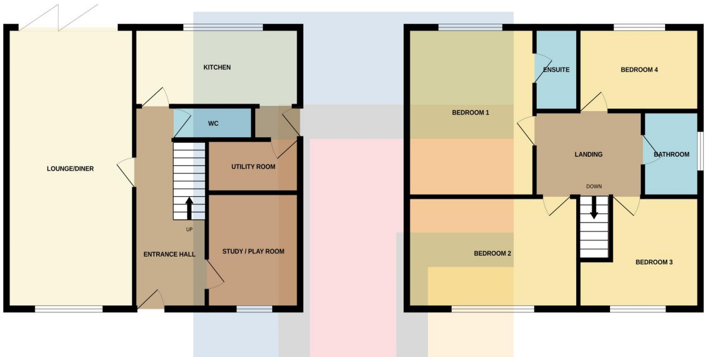
1ST FLOOR 646 sq.ft. (60.0 sq.m.) approx.

TOTAL FLOOR AREA : 1291 sq.ft. (120.0 sq.m.) approx.