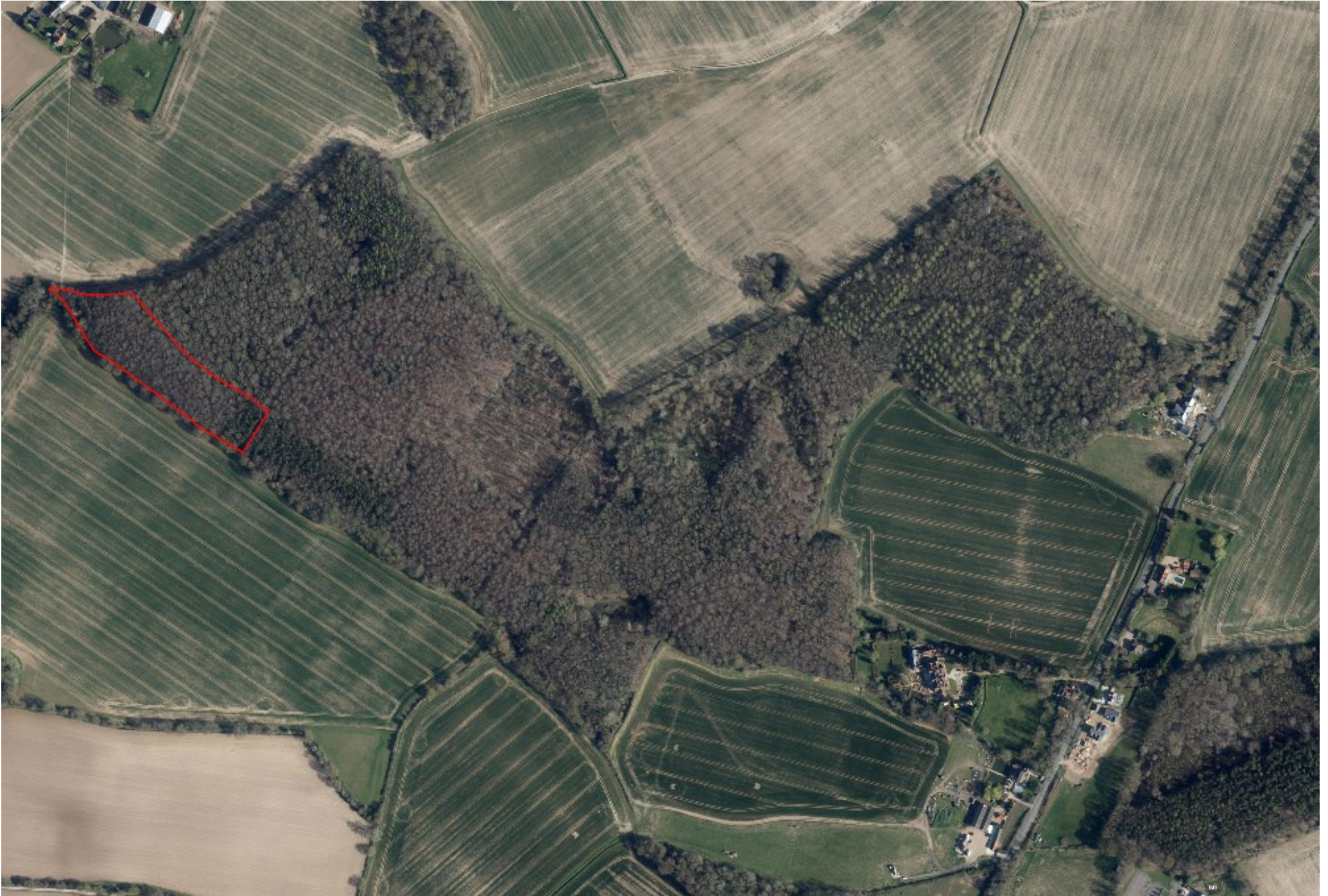
Beazley Wood, Gosfield, Essex. 3.49 acres, £59,500 (freehold)