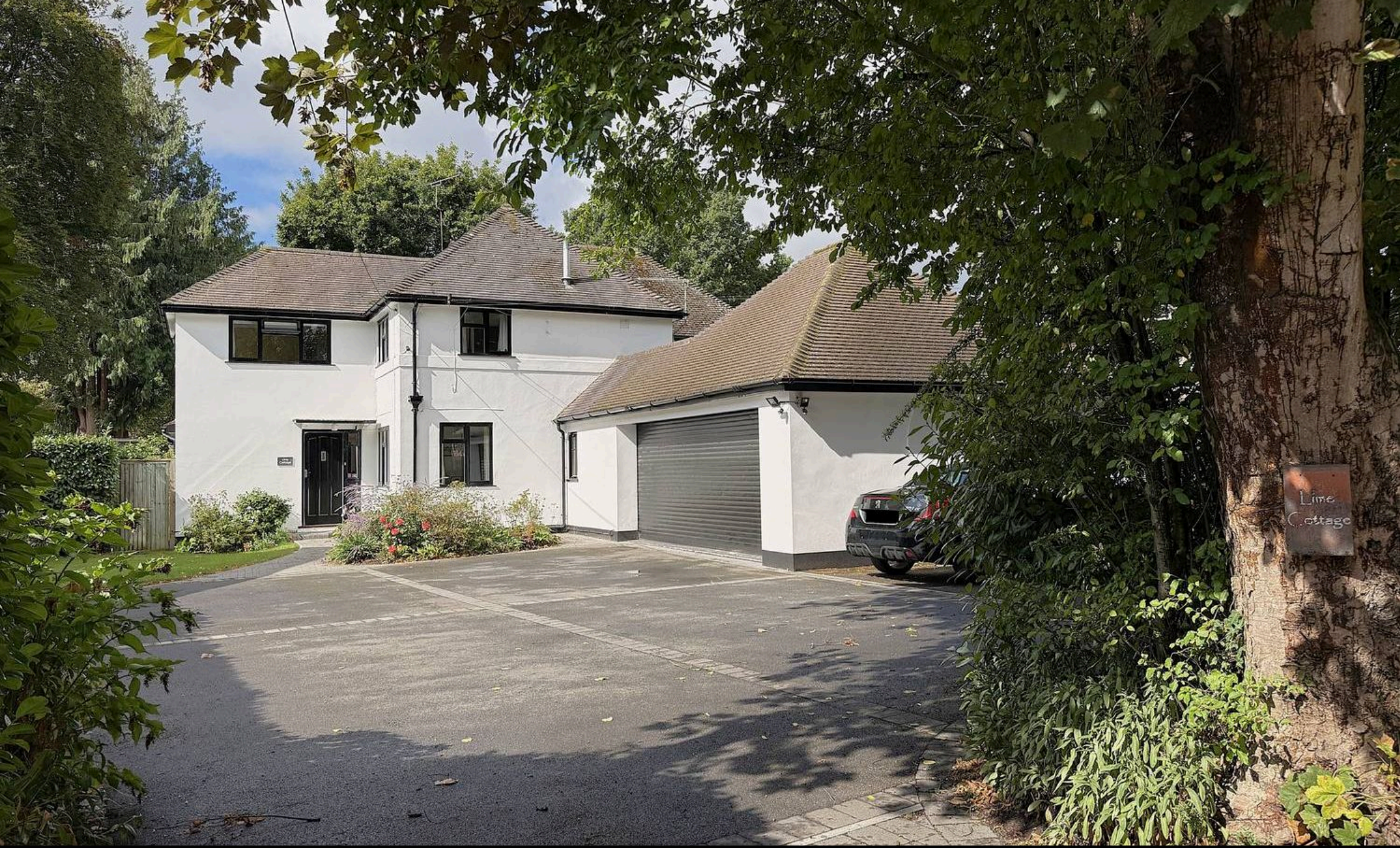
Lime Cottage Lime Walk, Dibden Purlieu £995,000