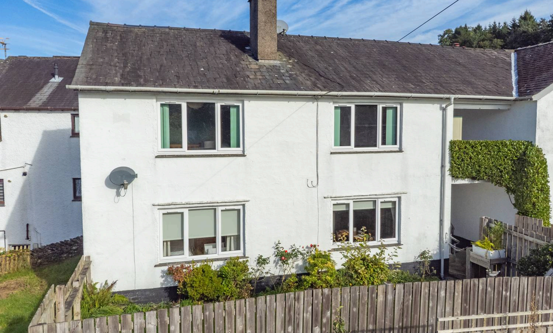
19 High Greenbank, Ambleside £210,000