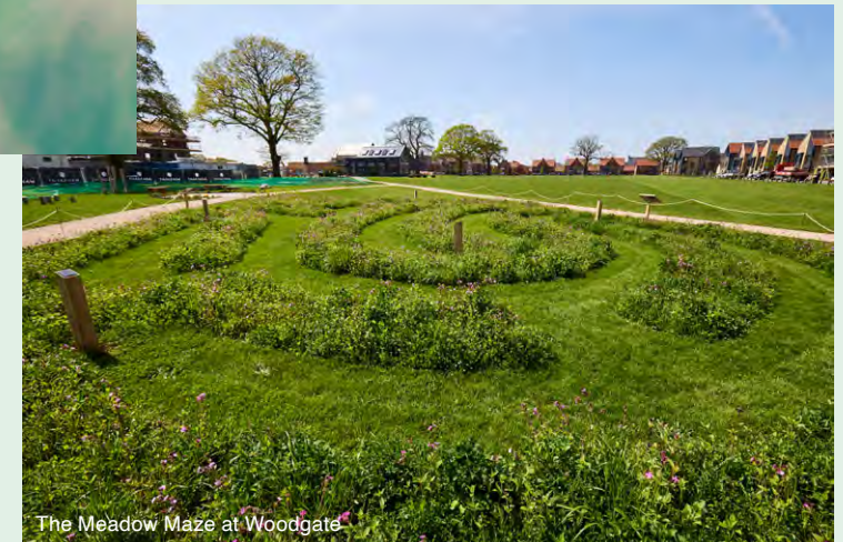
The Meadow Maze at Woodgate