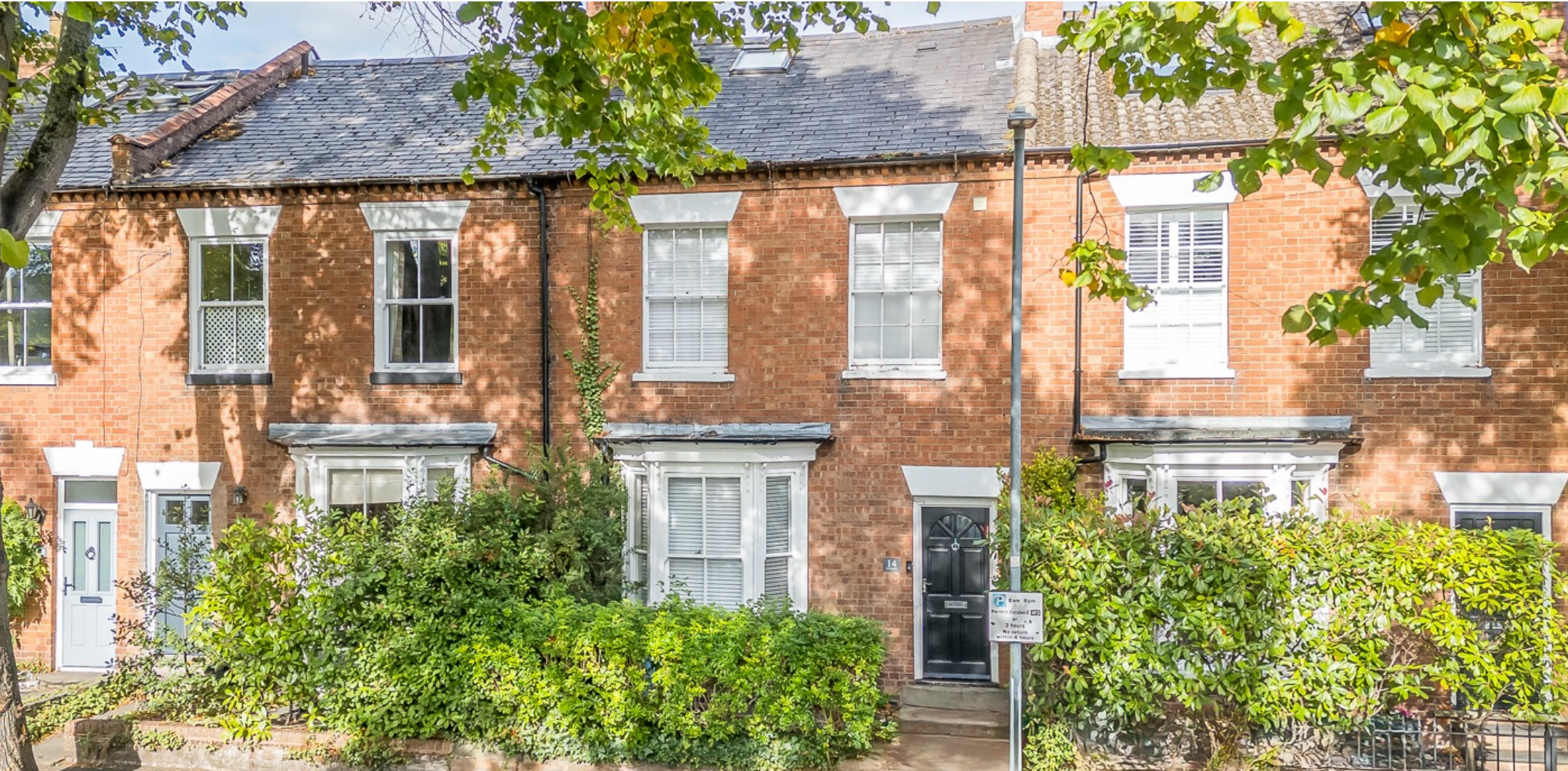
Broad Street Warwick, CV34 4LT