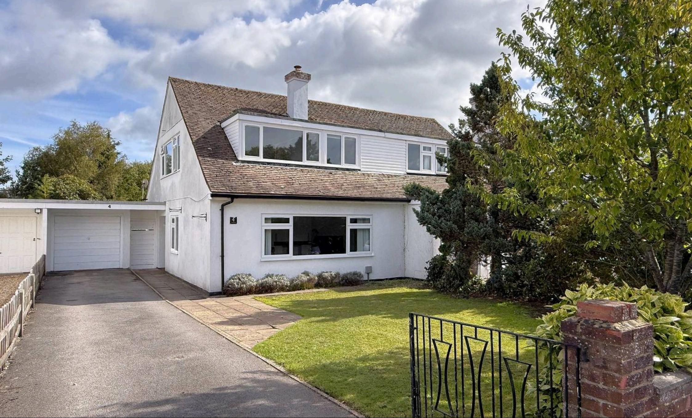
4 Fairview Drive, Hythe £389,950