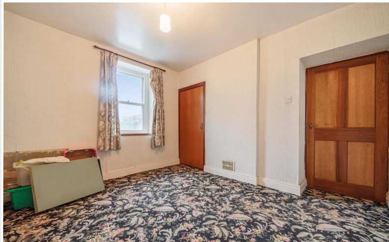
Sitting Room/Bedroom Three