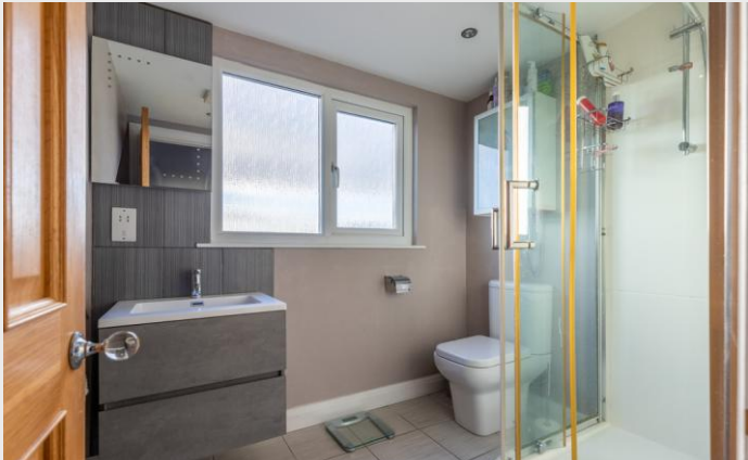
En-Suite Shower Room to Master