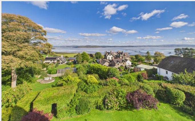
Garden and View