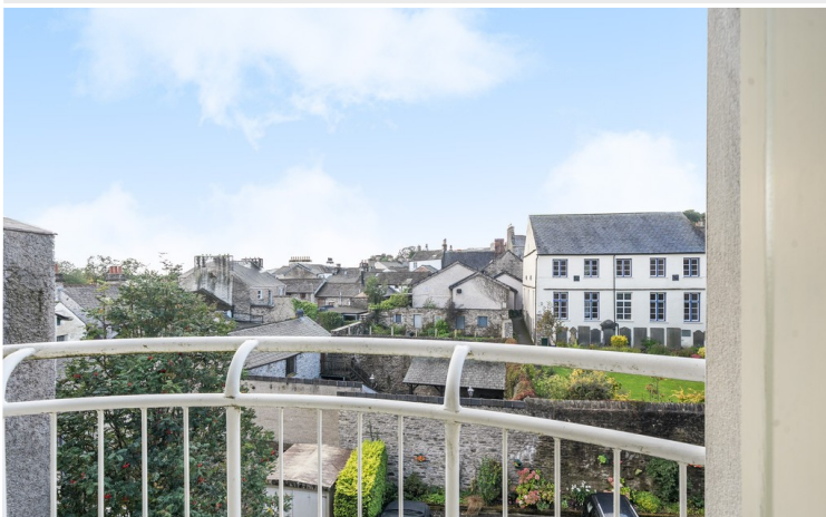
View from balcony