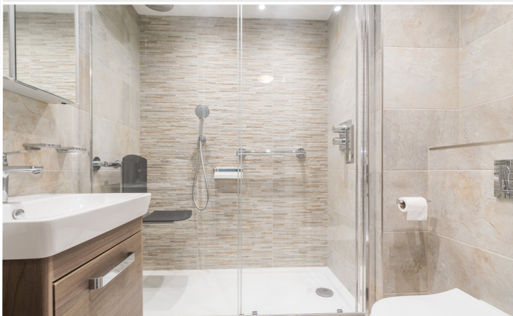
Modern Shower Room