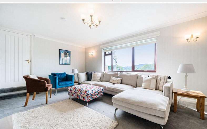
Living Room (6a)