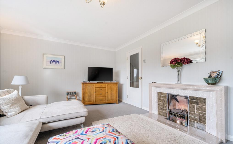
Living Room (6a)