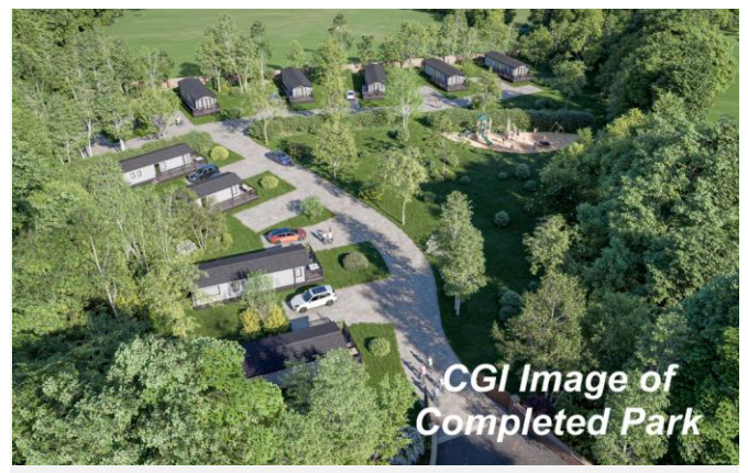
CGI Image of Completed Park