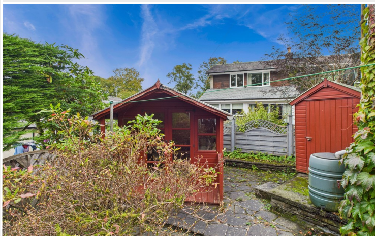
Summer house & Shed