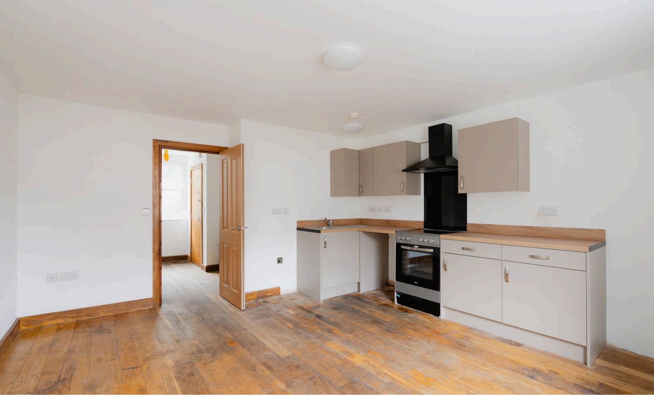
Flat 7, 1 North Road, Holsworthy, EX22 6EJ £800 pcm