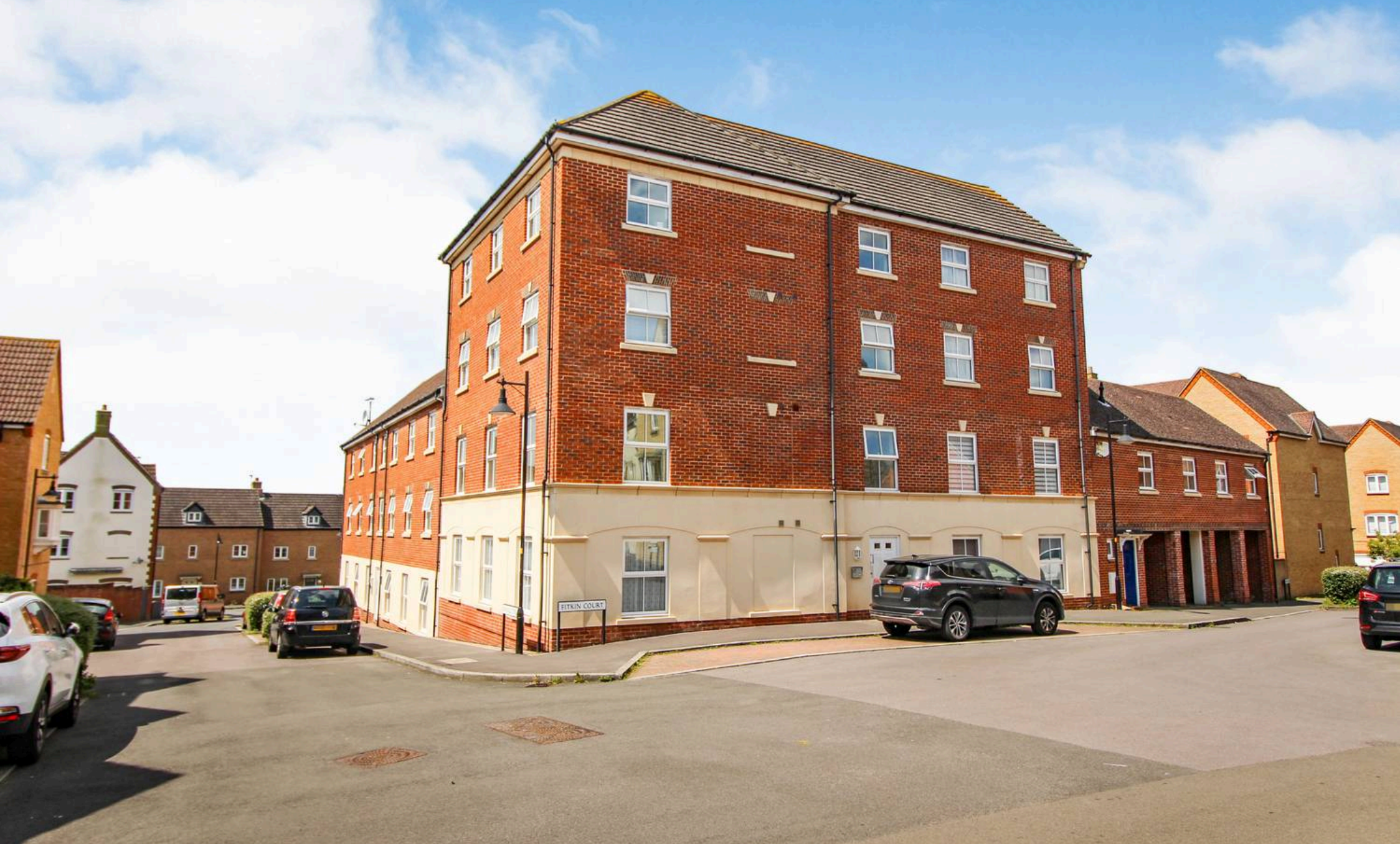
Flat 2, Delius House, 1 Arnold Street Swindon