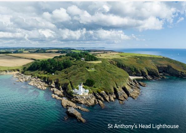
St Anthony's Head Lighthouse

Travel times by car (Estimate only) Truro train station – 10 mins Truro hospital – 13 mins Newquay airport – 40 mins Airport Supermarket School/College Medical Restaurant