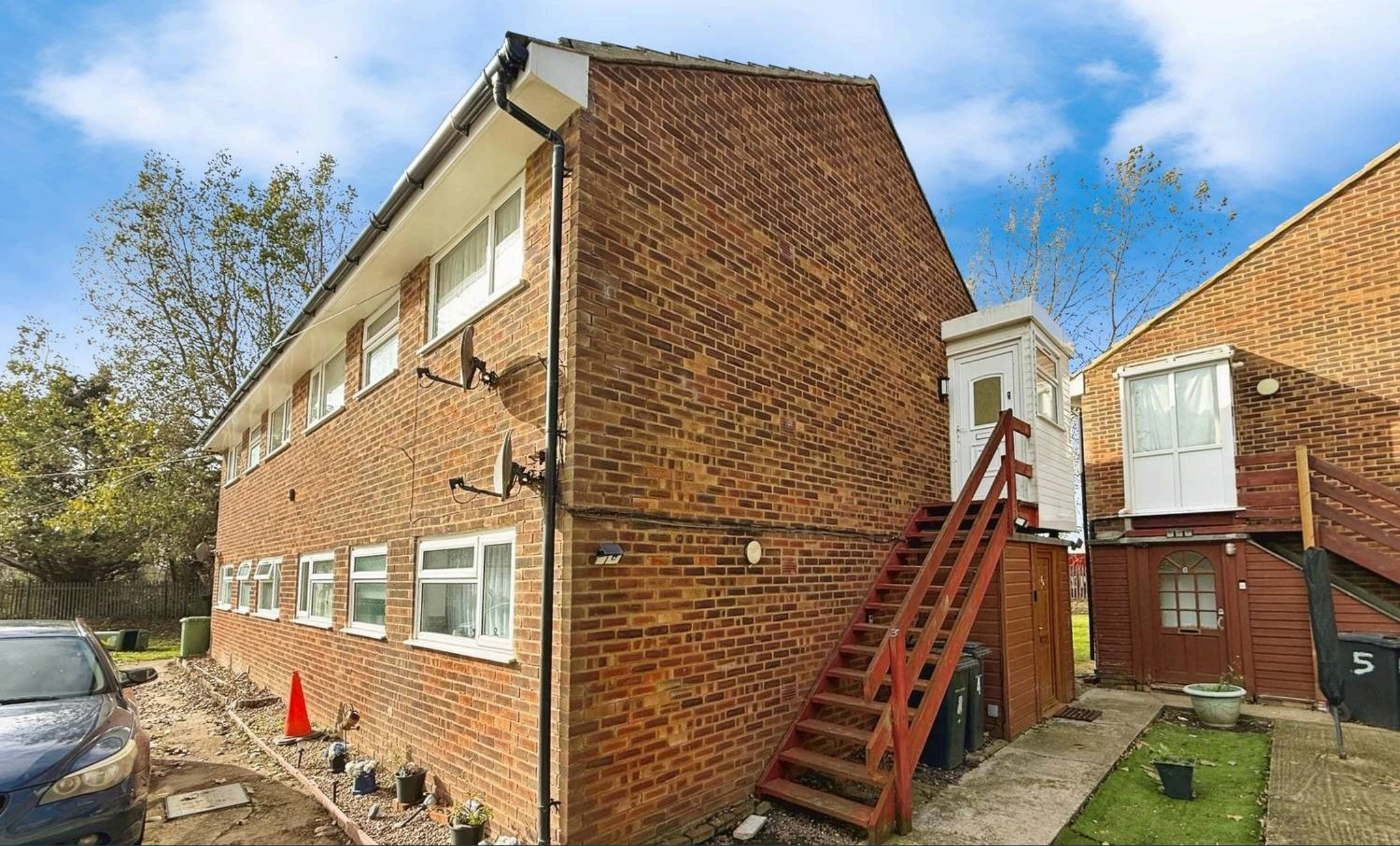
3 Fleetway Court New Lydd Road, Camber £130,000