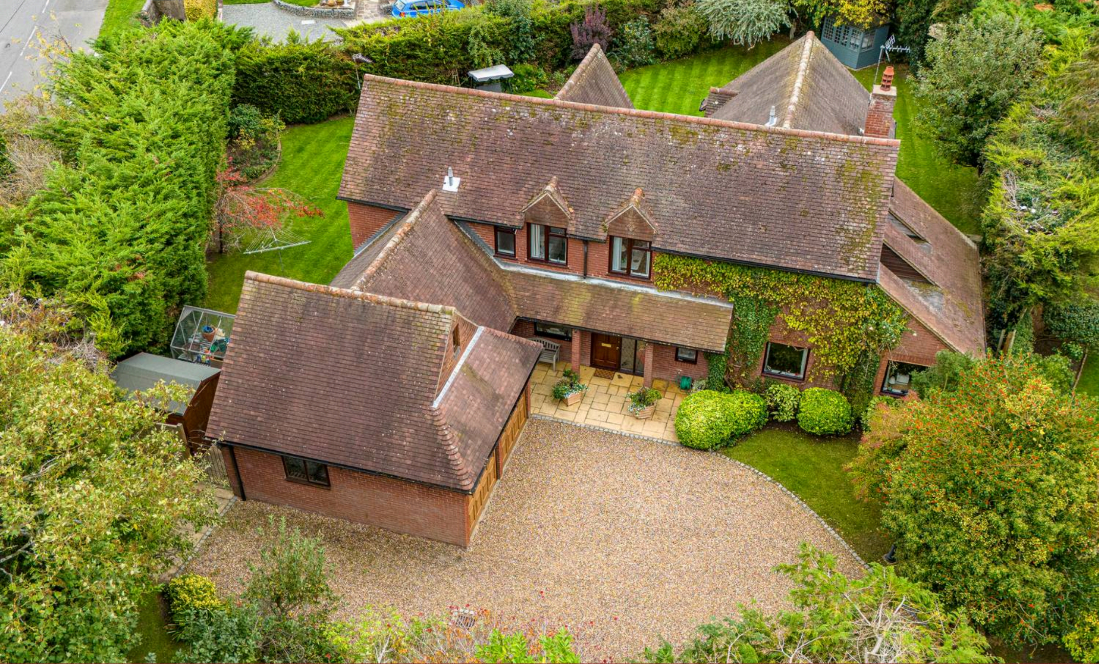
Lodge Farm Close, Weston Turville £950,000