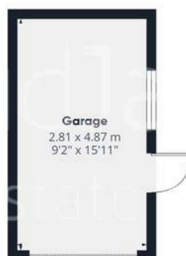
Floor 0 Building 2