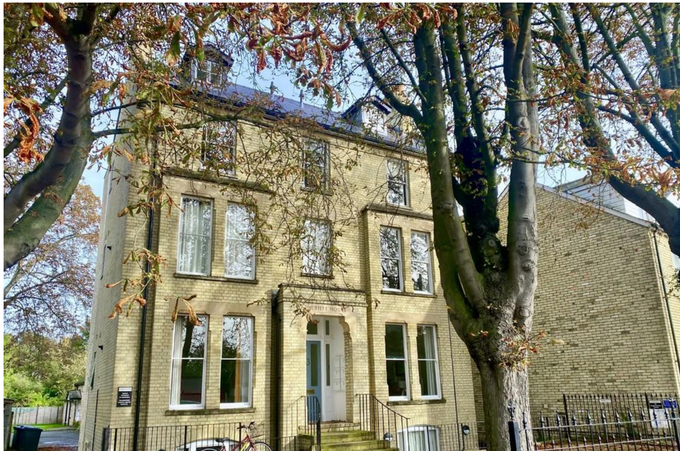
Hooper Street, Cambridge