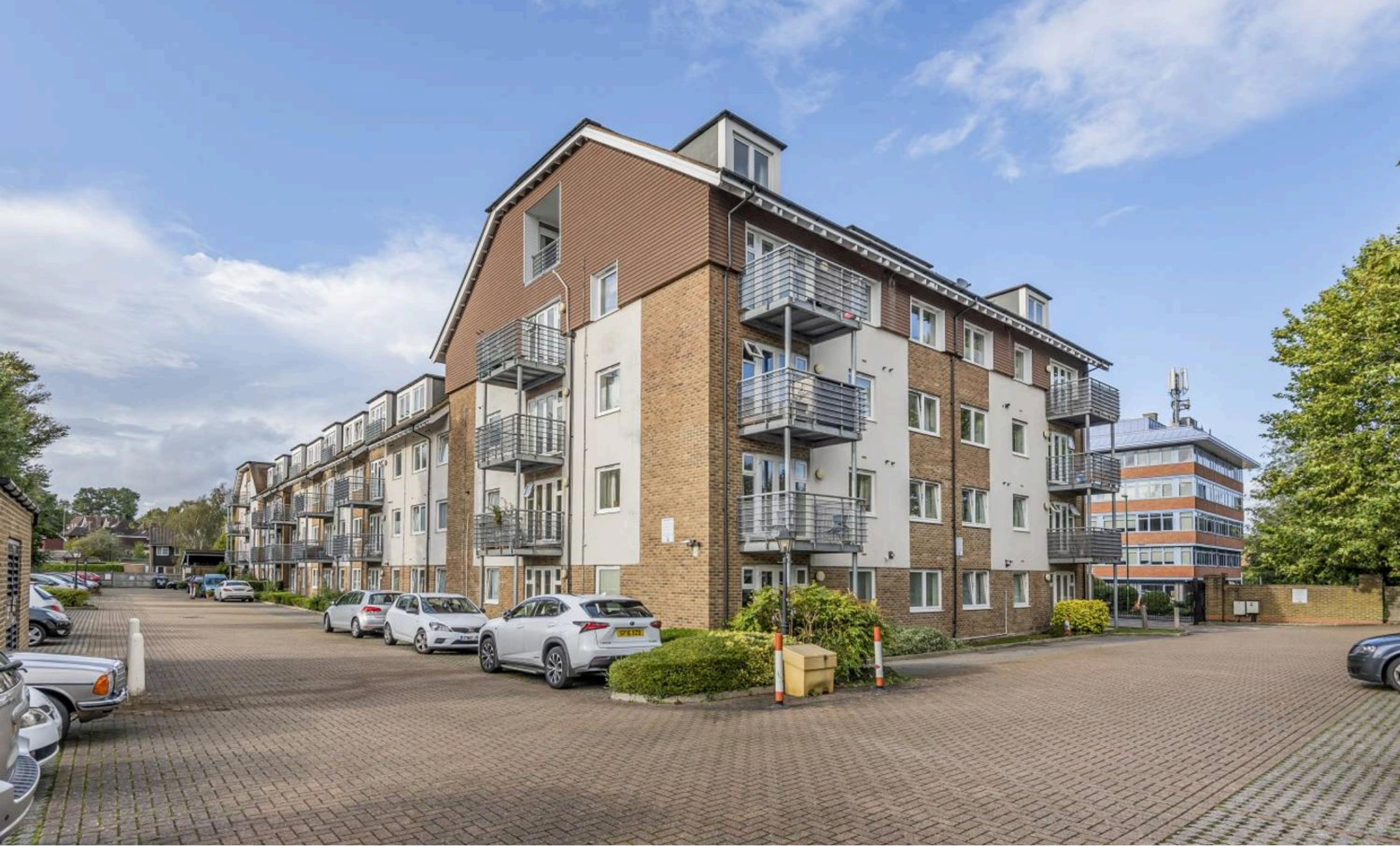
Flat 11, Harlands House, Haywards Heath RH16 1LA £250,000