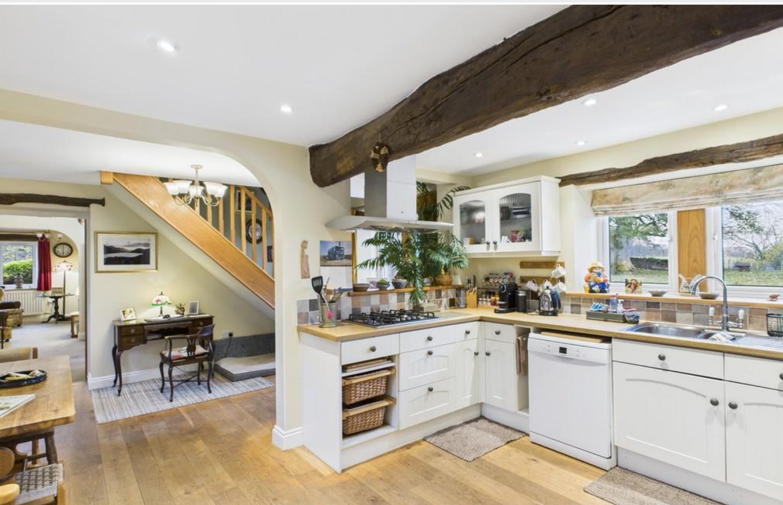
Entrance Hall & Kitchen