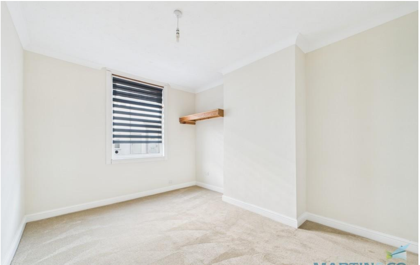
BEDROOM 13' 6" x 10' 8" (4.11m x 3.25m) To front aspect. Ceiling cornice, central heating radiator, open wardrobe, carpet flooring and uPVC window.