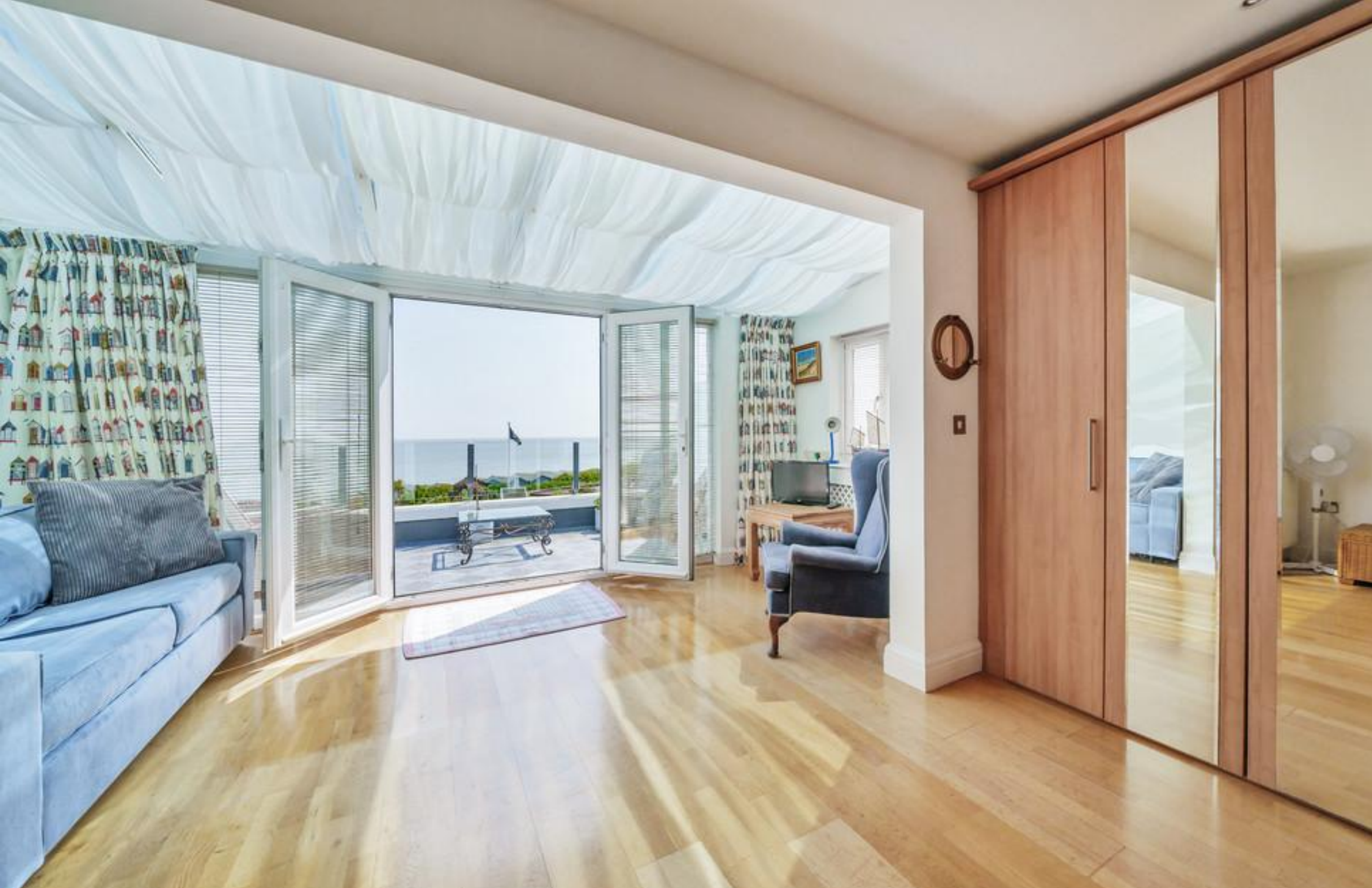
Green Lane, Walton On The Naze, CO14 8HF