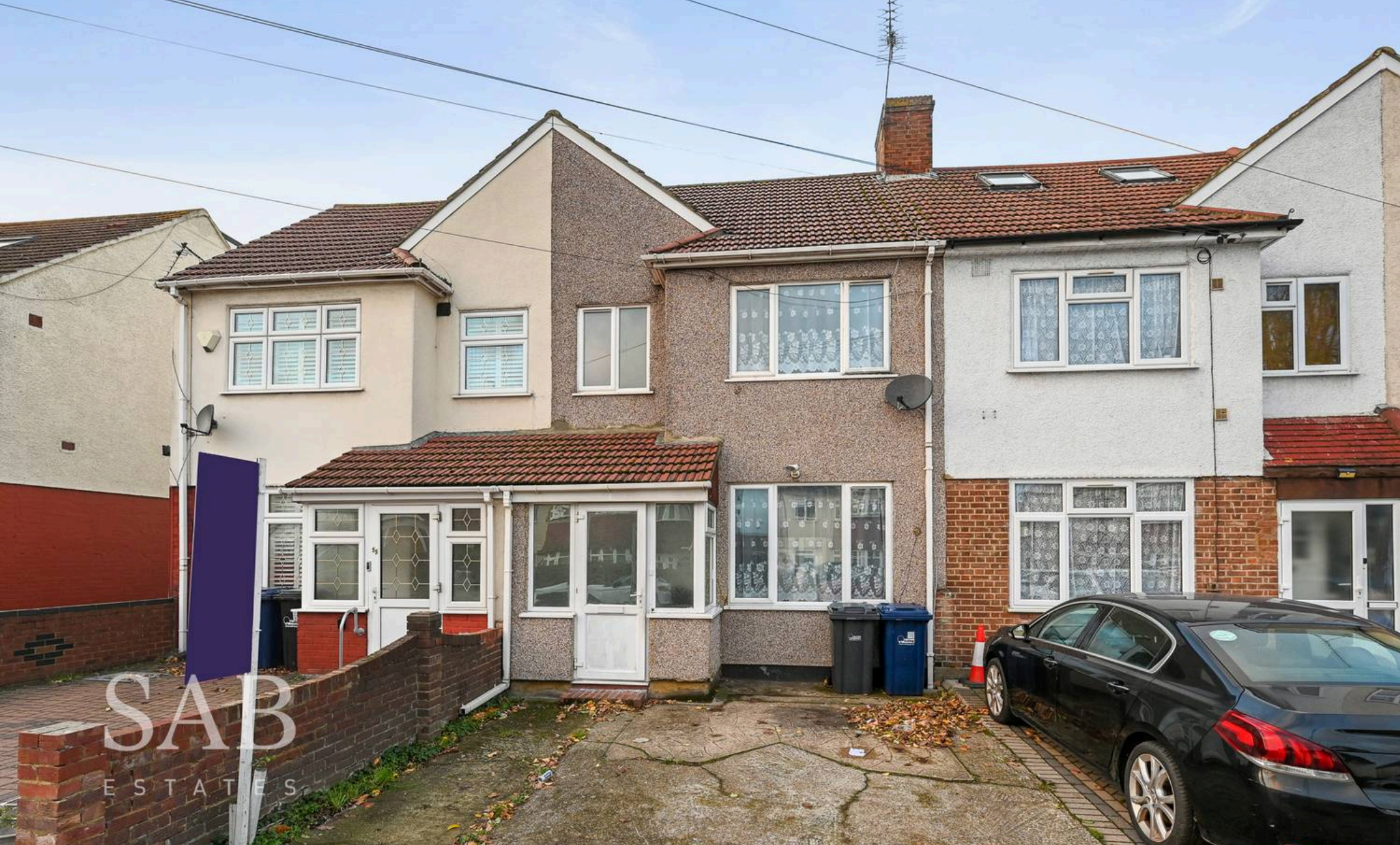
Allenby Road, Southall £535,000