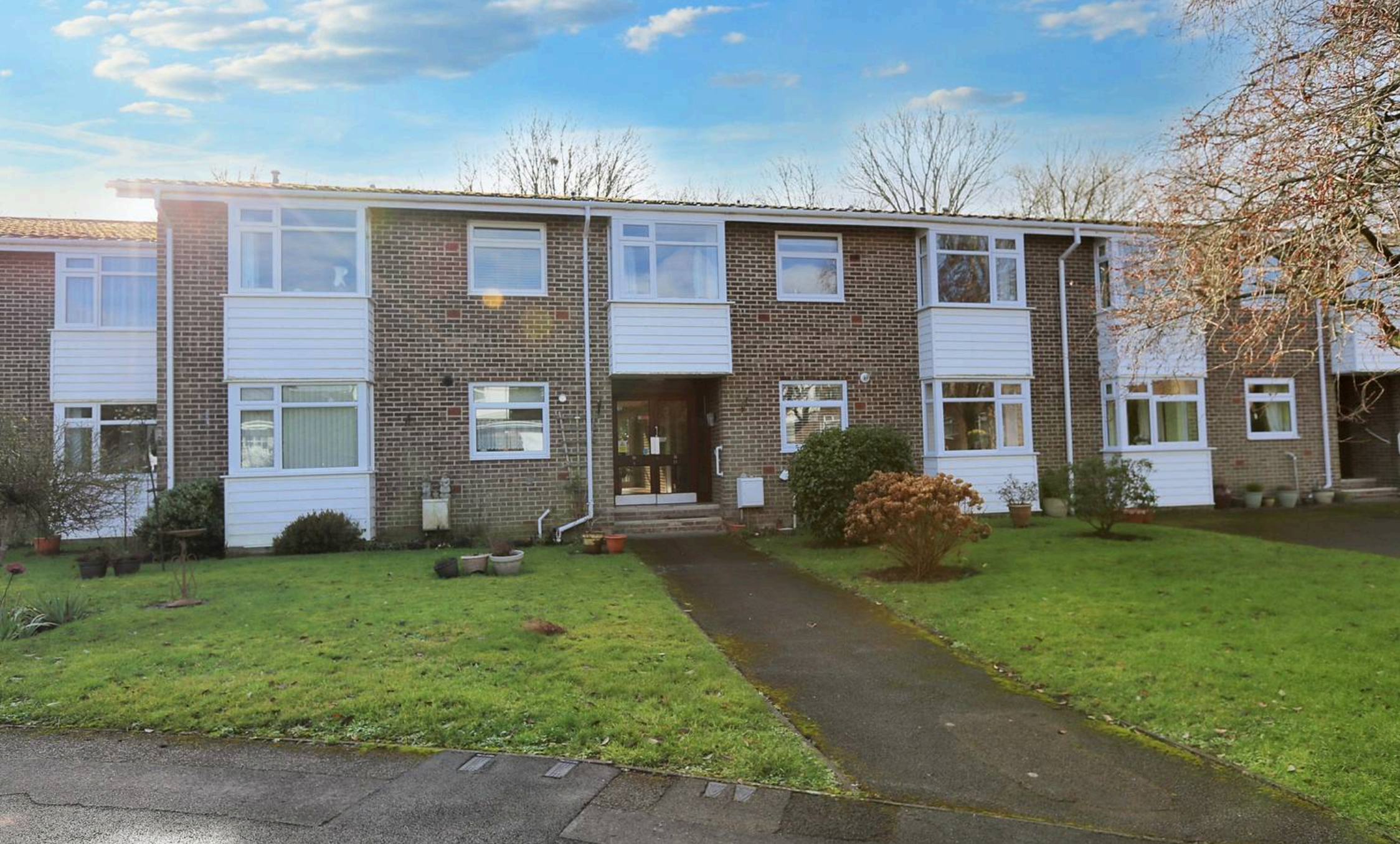
Flat 9, Anfield Court Anfield Close, Fair Oak - SO50 7LF £230,000