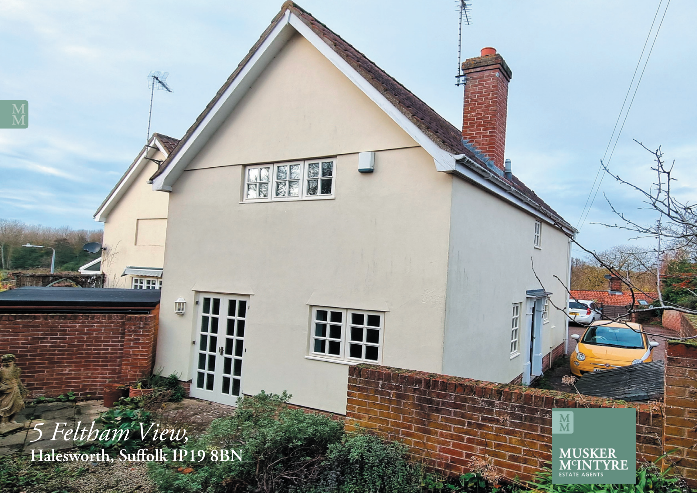
5 Feltham View, Halesworth, Suffolk IP19 8BN