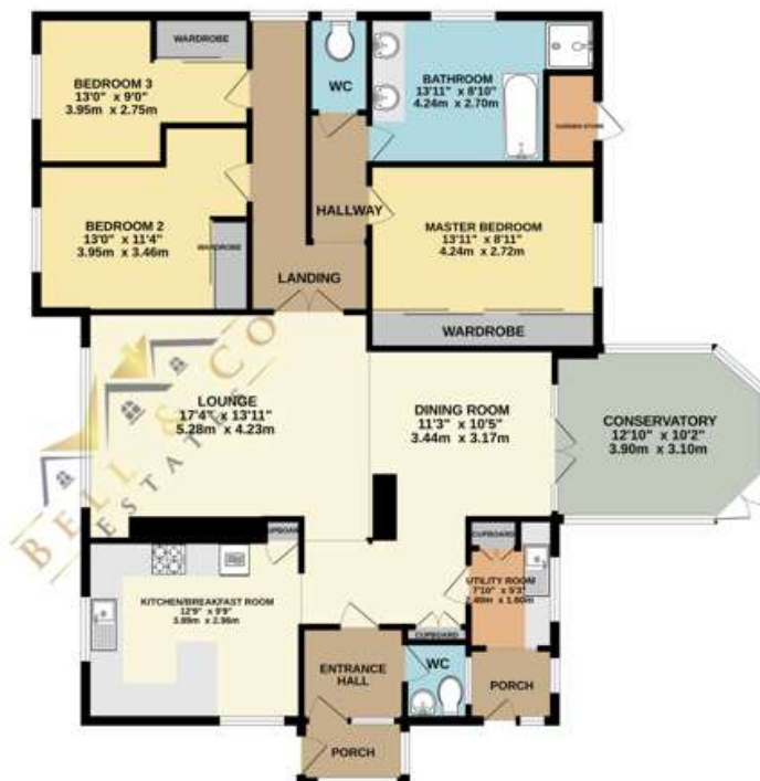
TOTAL FLOOR AREA : 1809 sq ft. (168.0 sq.m.) approx.

Whilst every attempt has been made to ensure the accuracy of the floorplan contained here, measurements of doors, windows, rooms and any other items are approximate and no responsibility is taken for any error, omission or mis-statement. This plan is for illustrative purposes only and should be used as such by any prospective purchaser. The services, systems and appliances shown have not been tested and no guarantee as to their operability or efficiency can be given. Made with Metronix i2300f.