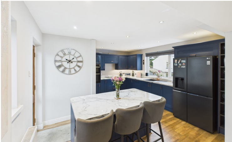
Open plan living / dining / kitchen