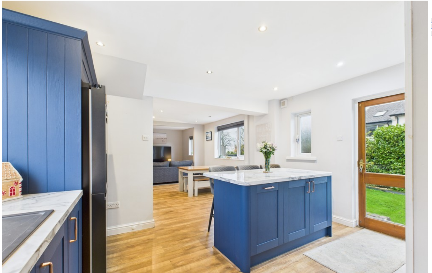
Open living/ dining / kitchen