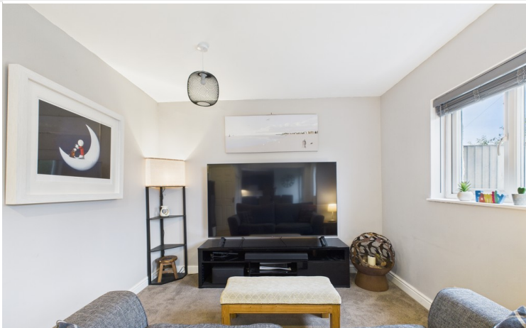
Open plan living / dining / kitchen

A small porch opens into a welcoming entrance hall, where the staircase rises to the first floor. To the left, the cosy living room enjoys a front-aspect bay window, allowing natural light to fill the space. A contemporary media wall with alcove shelving, TV recess and an electric log fire creates a warm focal point for relaxed evenings.