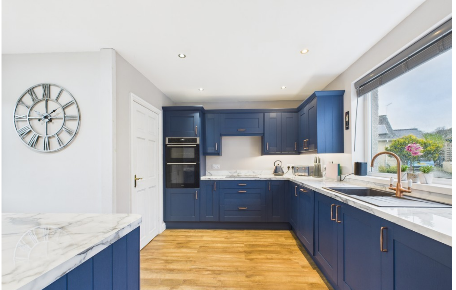
Open plan living / dining / kitchen