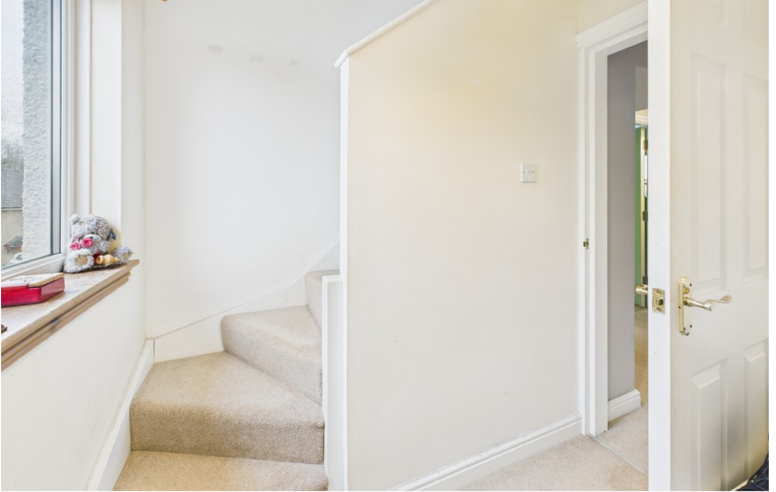
Stairway to Bedroom Four