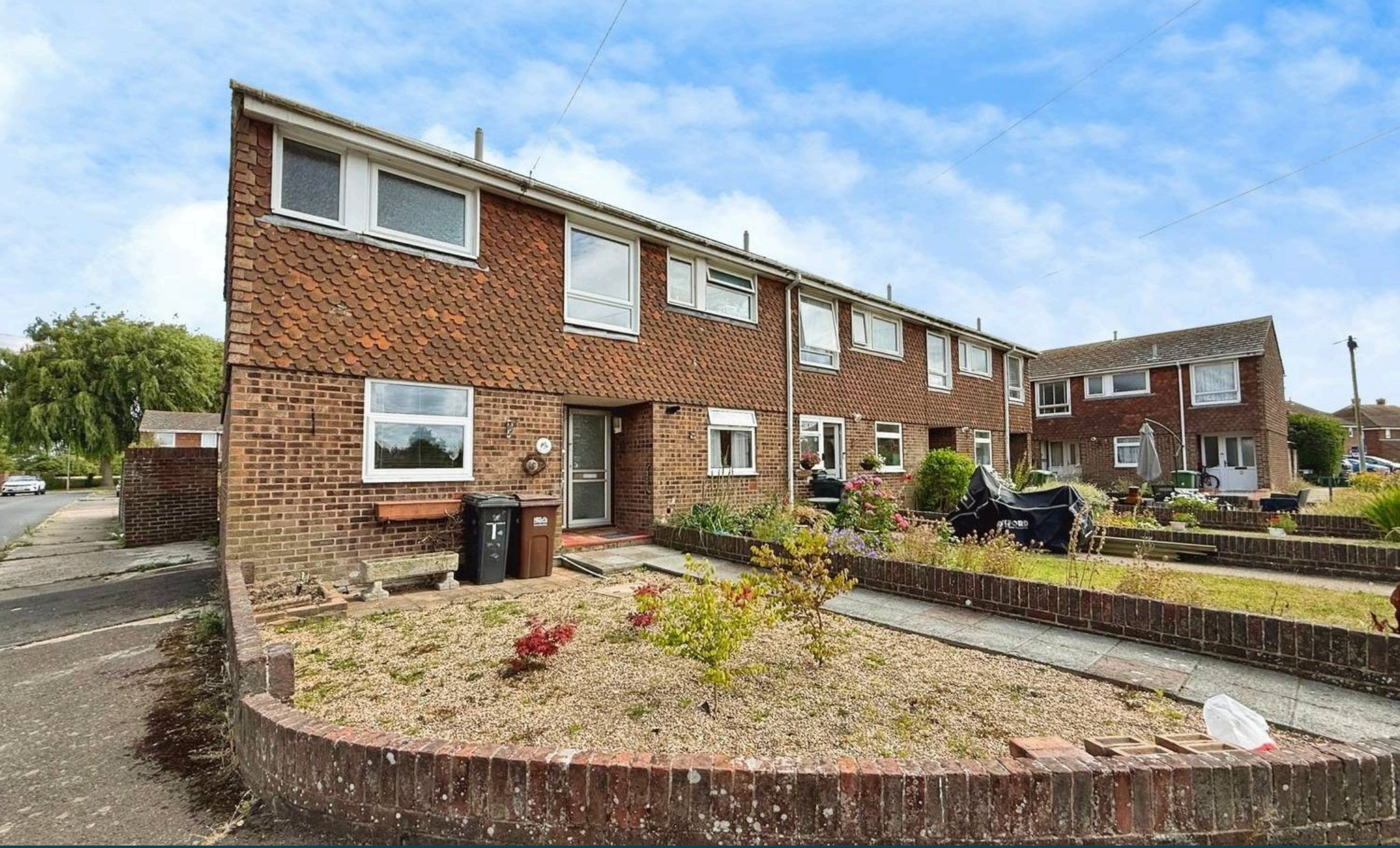
1 Bankside, Rye £228,000