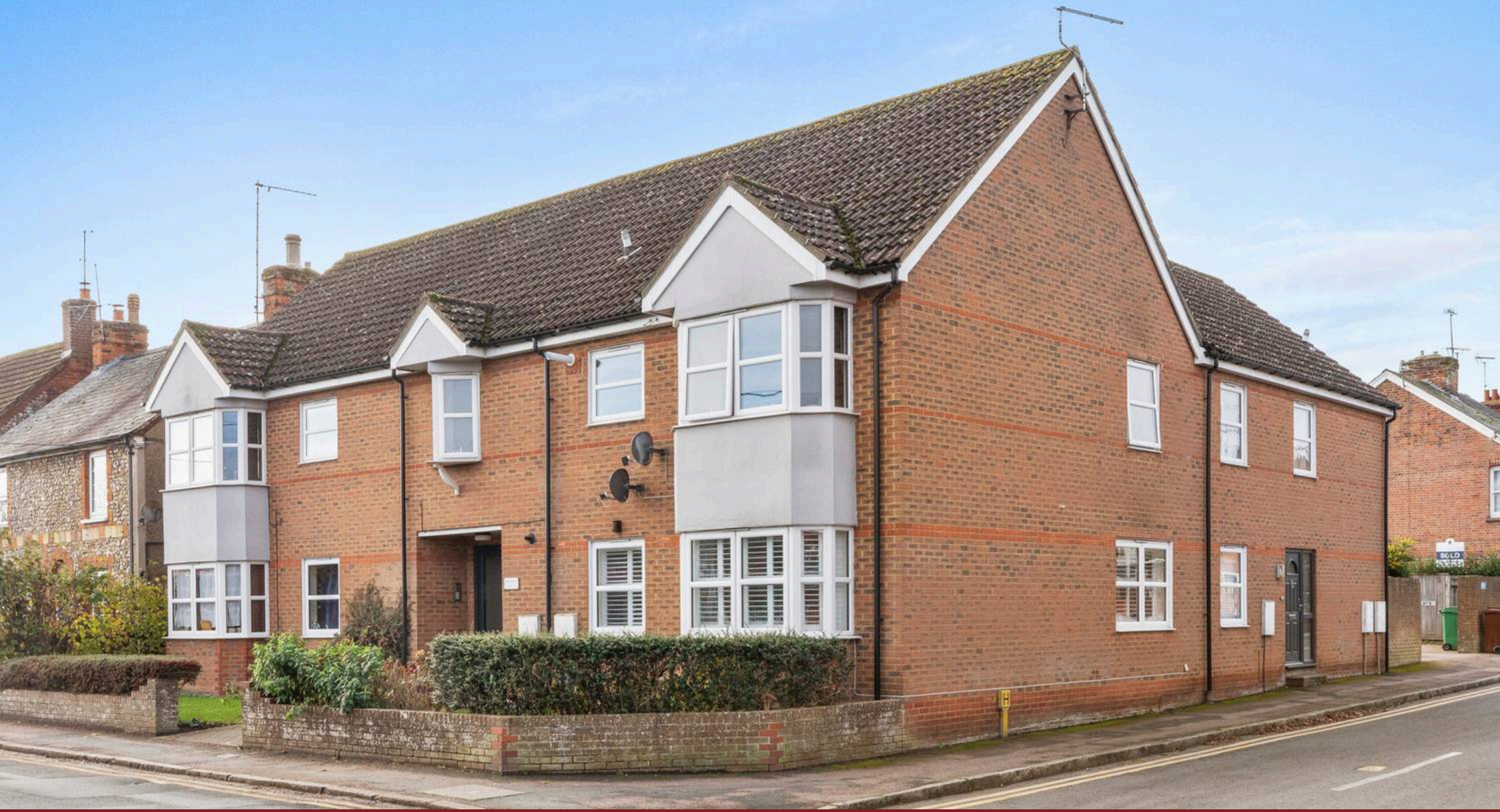
The Perrys, Wendover £290,000