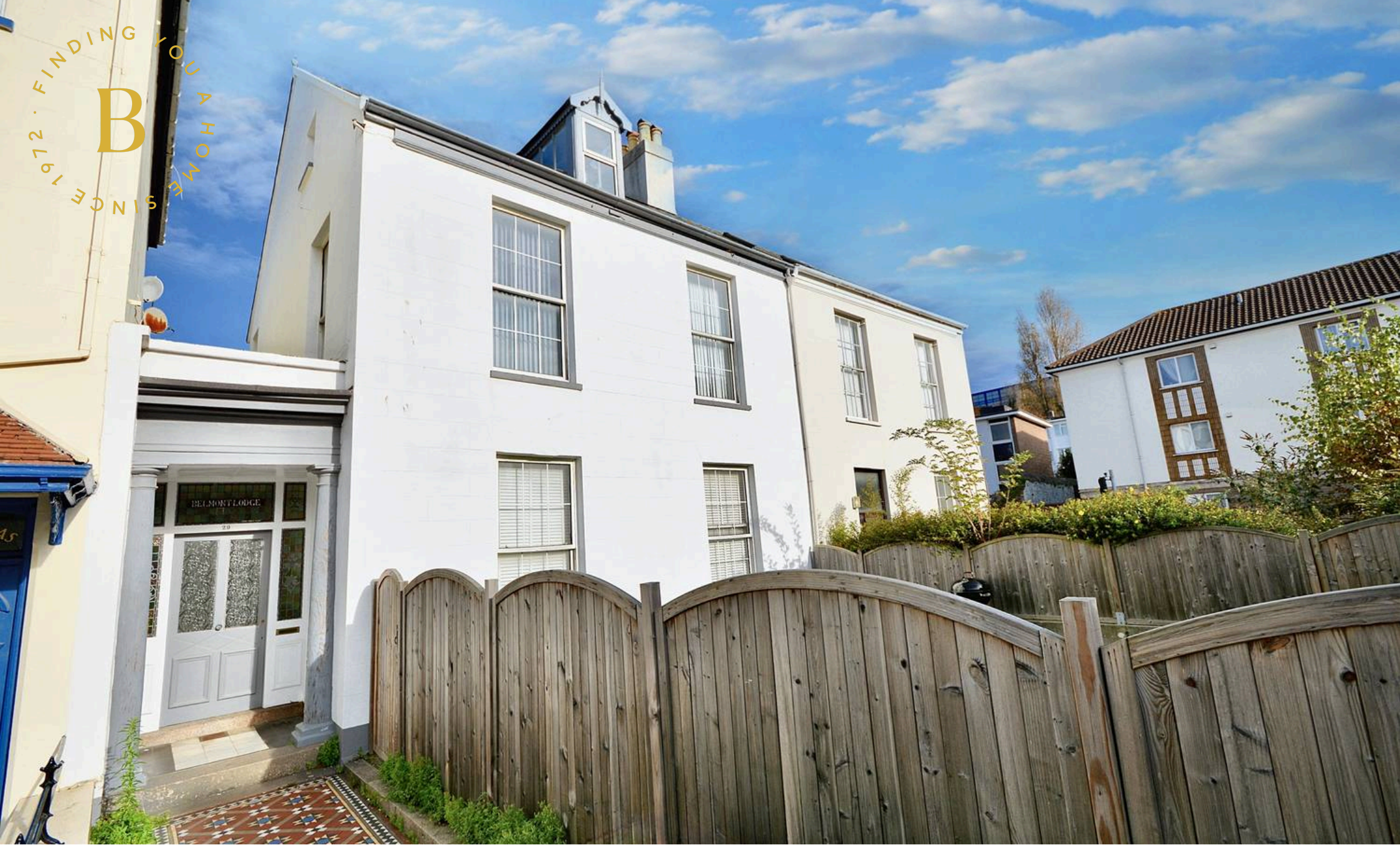
Flat 4, Belmont Lodge, 29 Simon Place, St. Helier £290,000

BROADLANDS FINDING YOU A HOME SINCE 1972