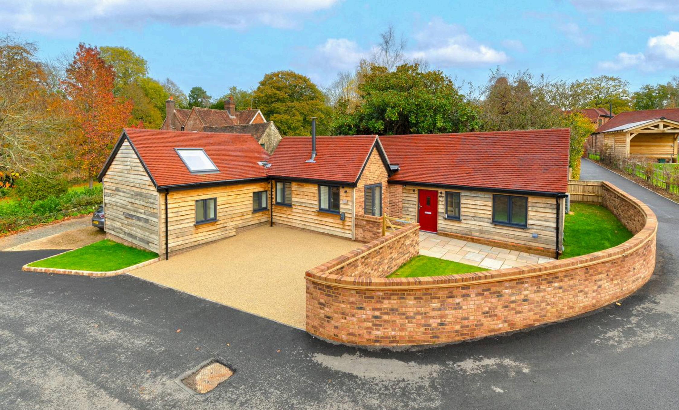
The Gatehouse, Manor Court Farm Ashurst Road – TN3 9TB Tunbridge Wells