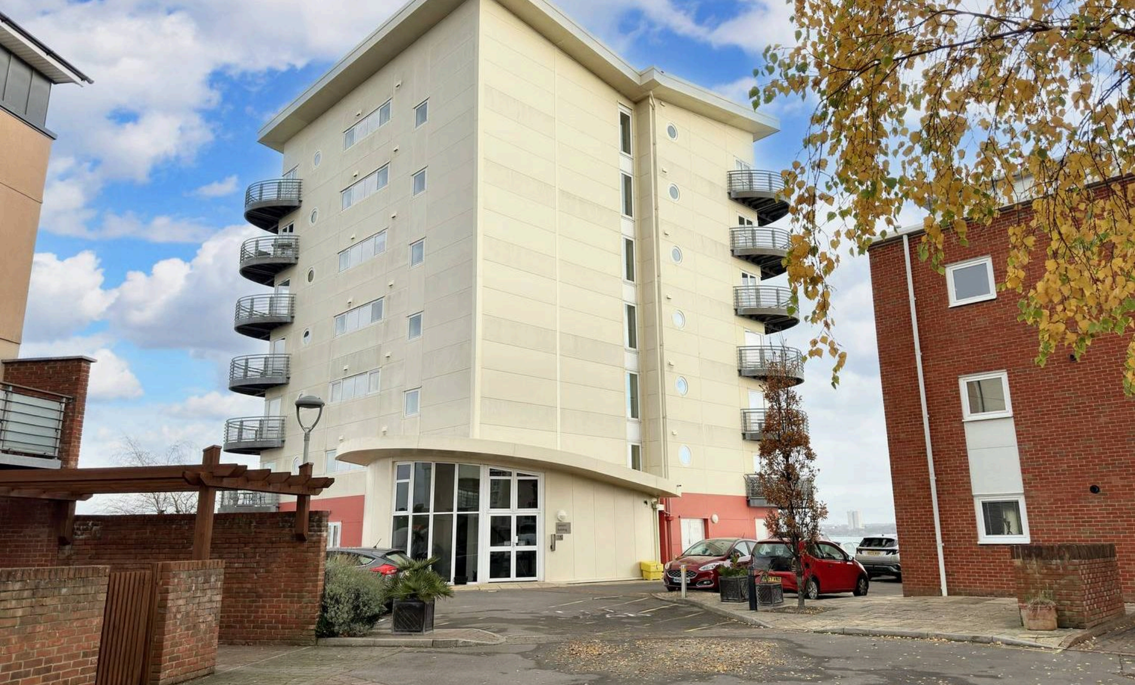
1 The Lantern Building Davidson Close, Hythe £112,500