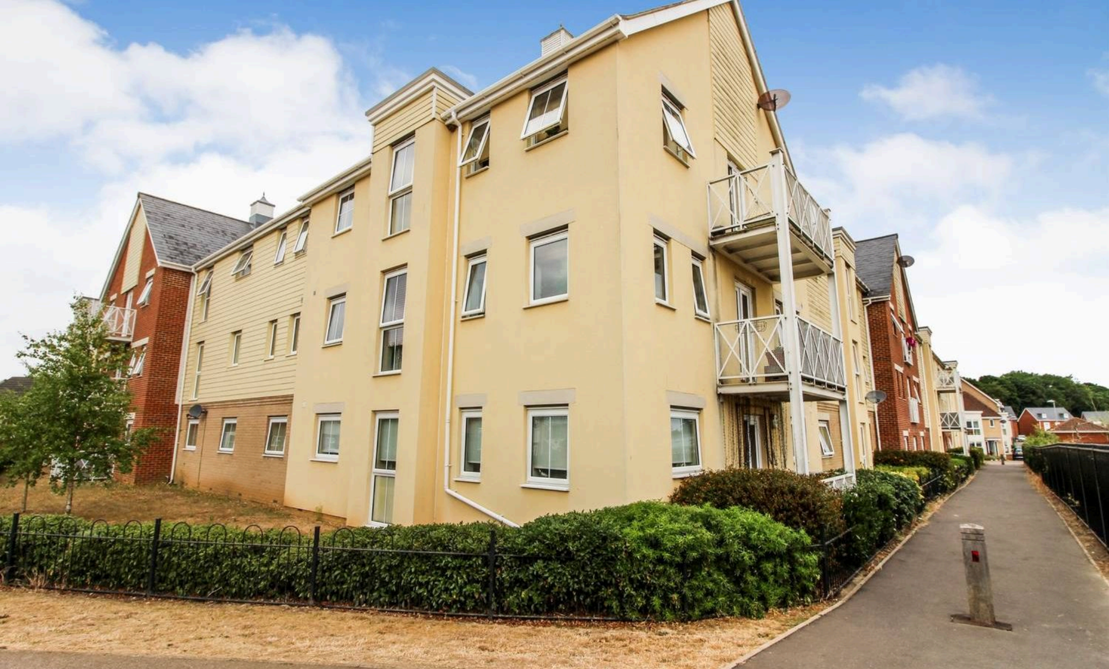
Cheena Court Solario Road, Costessey - NR8 5EP