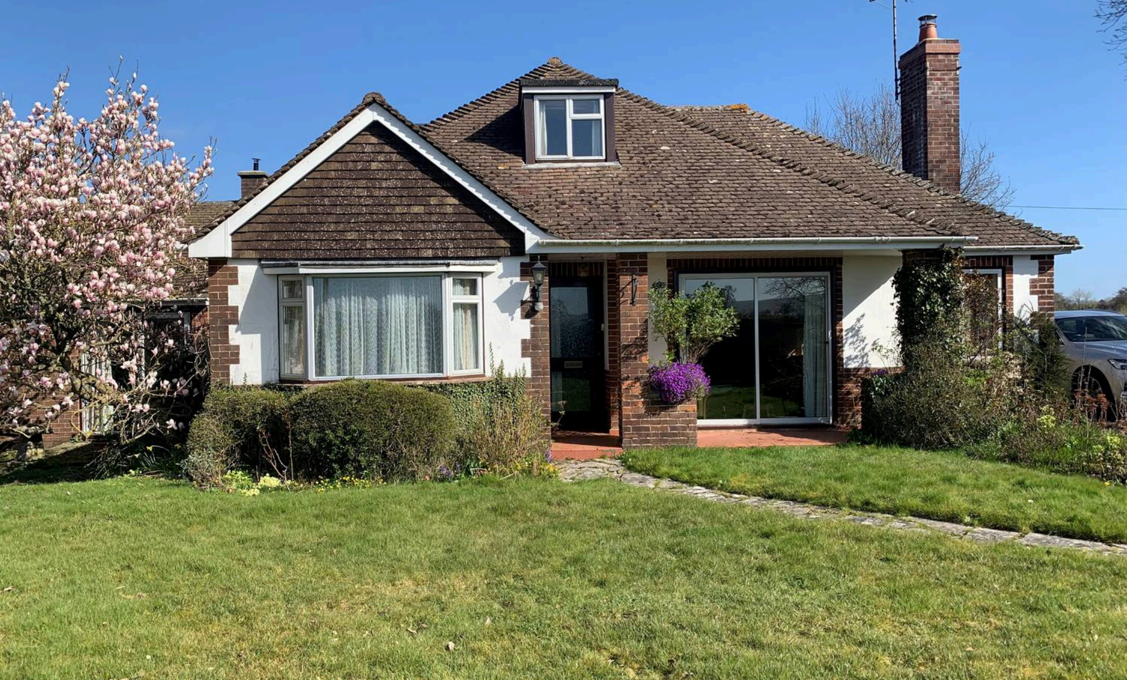
The Totterells, Littleworth £1,850 pcm