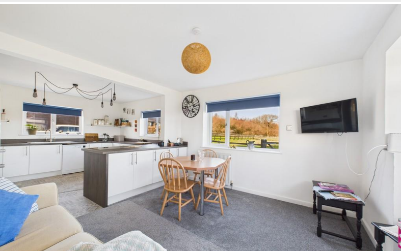
Open Plan Kitchen Diner