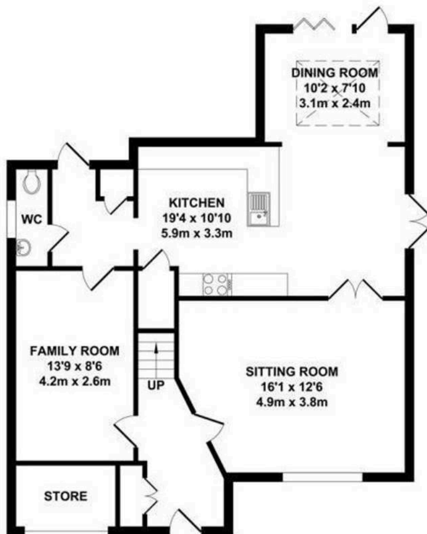
GROUND FLOOR APPROX. FLOOR AREA 794 SQ. FT. (73.81 SQ. M)