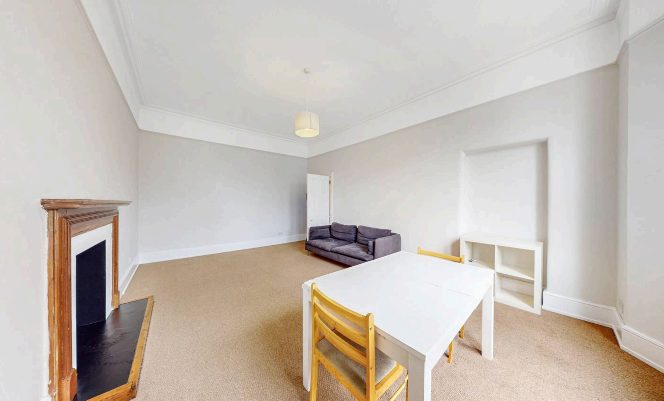
Flat 2a, 131 West End Lane, London £2,300 pcm