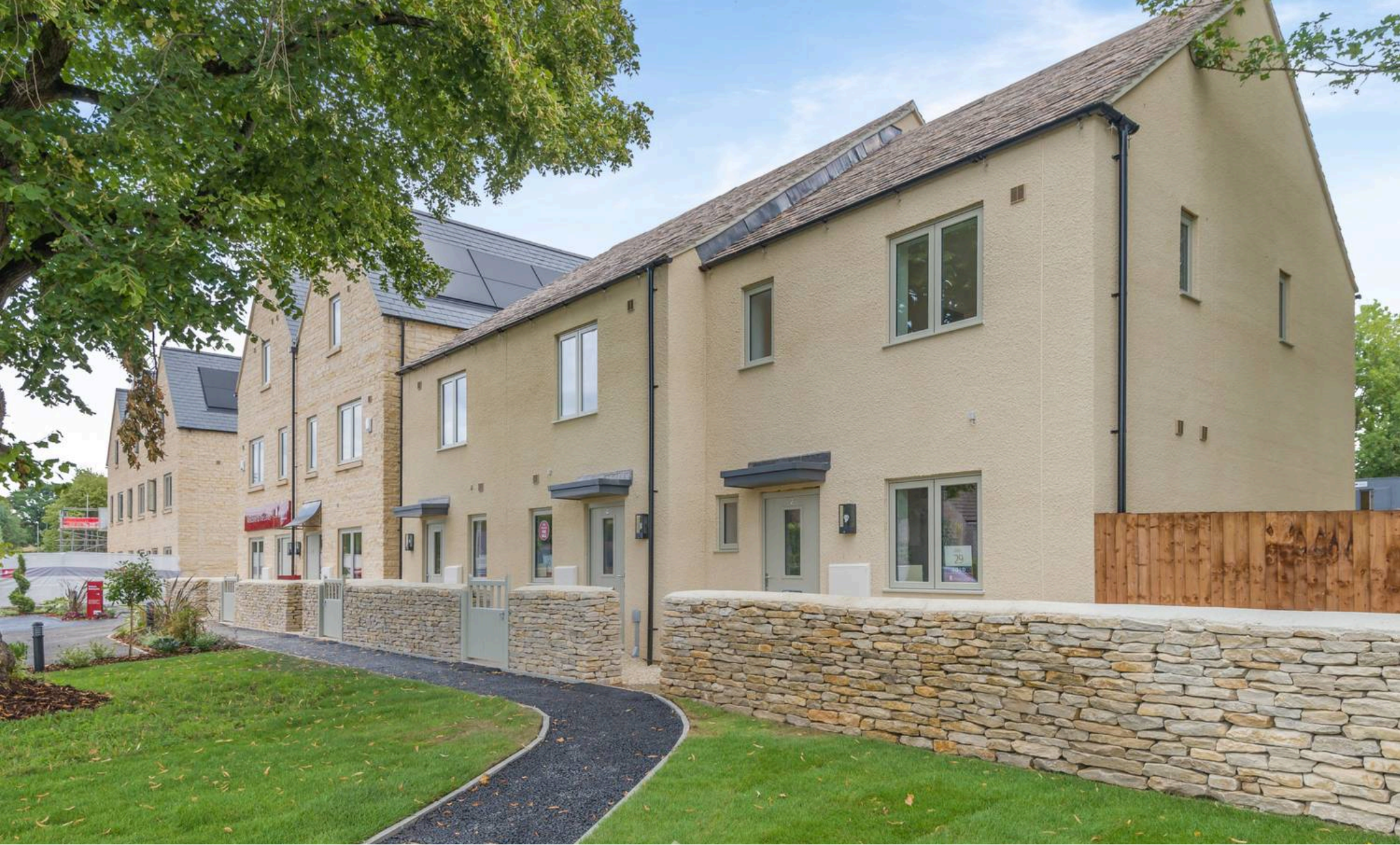
The Northfield, London Road Tetbury